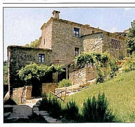
Fancy your own place in Tuscany? See pages 50 - 51