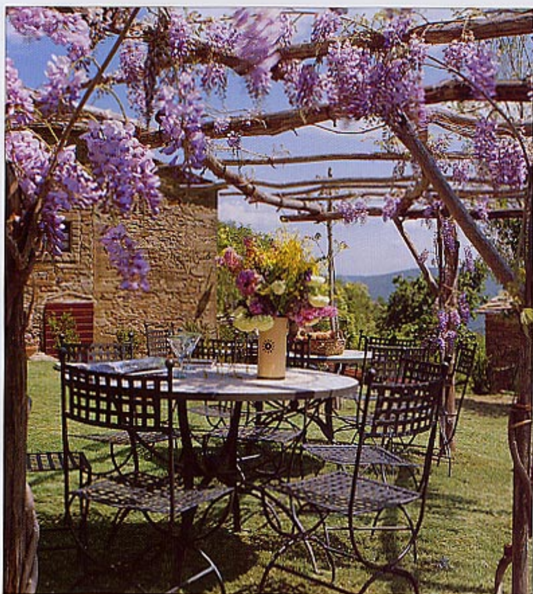
LEFT: Wisteria-covered pergolas shade the mosaic-topped tables and wrought iron chairs in an alfresco dining area. Visitors are greeted in the building at left. RIGHT: The living room of L' Antico Focolare.